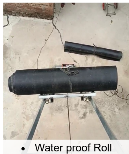
• Water proof Roll