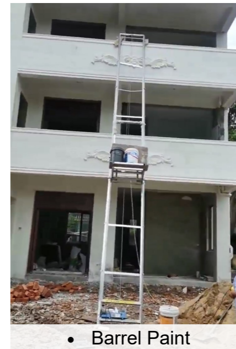
• Barrel Paint