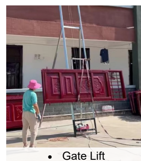
• Gate Lift