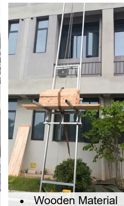
• Wooden Material