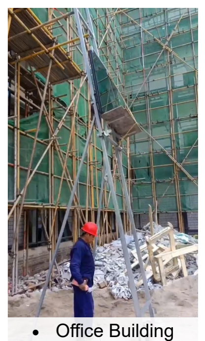
• Office Building