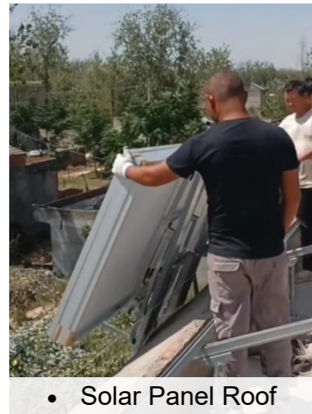
• Solar Panel Roof