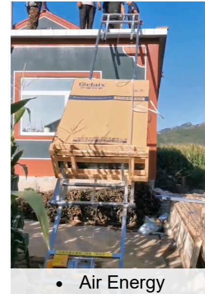
• Air Energy