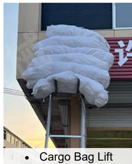
• Cargo Bag Lift