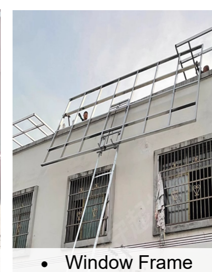
• Window Frame