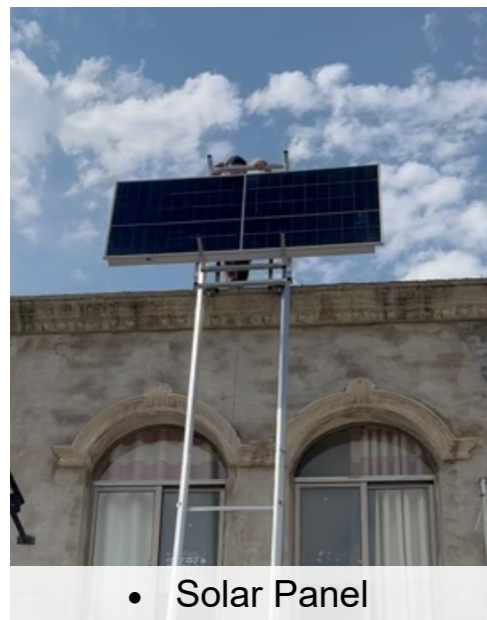
• Solar Panel