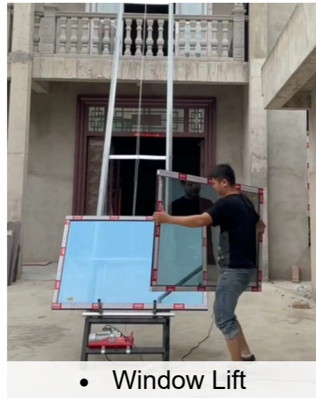
• Window Lift