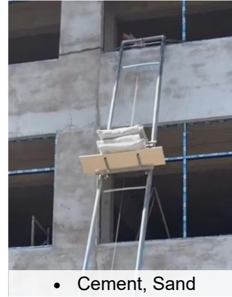
• Cement, Sand