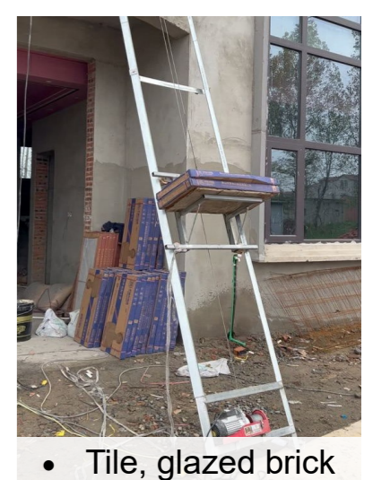
• Tile, glazed brick