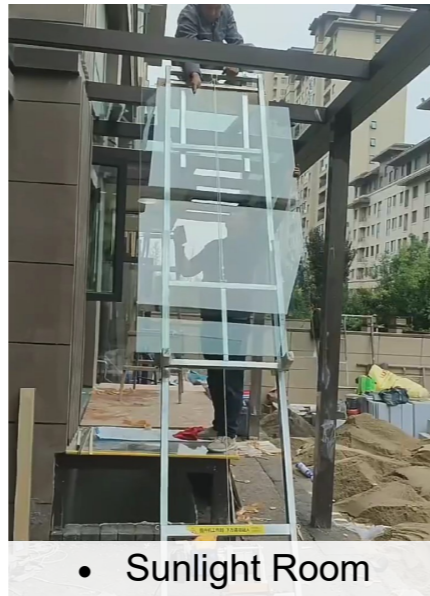
• Sunlight Room