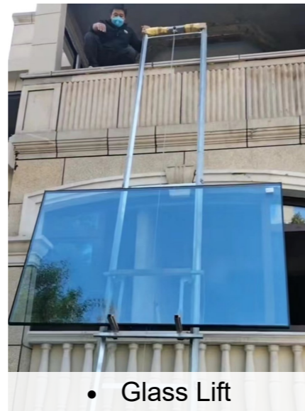
• Glass Lift